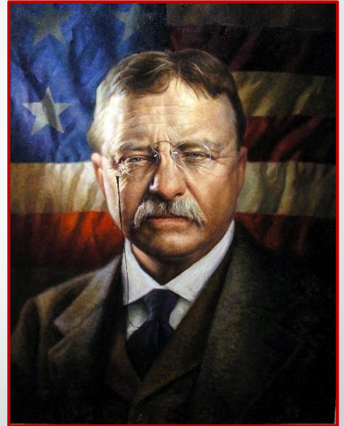
President Teddy Roosevelt 1908

No man has a moral right to withhold his support from an organization that is striving to improve conditions within his sphere.”